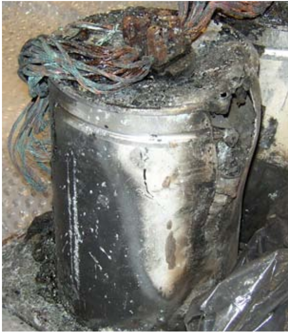
Fig. 4: Burst pressure vessel of a line filter capacitor