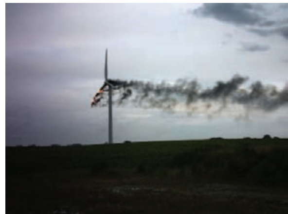
Fig. 1: Fire after lightning struck a 2 MW wind turbine in 2004

connection of the lightning protection system that was not correctly fixed. The electric arc between the arrester cable and the connection point led to fusion at the cable lug and to the ignition of residues of hydraulic oil in the rotor blades.